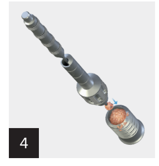
Repeat step 1 and insert the morselized bone graft into the Eclipse cage screw.