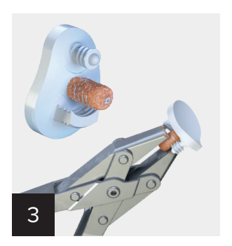
Use the autograft compression tool to place graft around the central peg of the VaultLock implant.