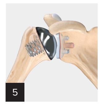
Complete your total shoulder reduction.