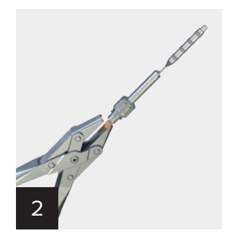
Remove the morselized autologous bone graft into the compression tool by inserting the plunger into the distal end of the harvester.