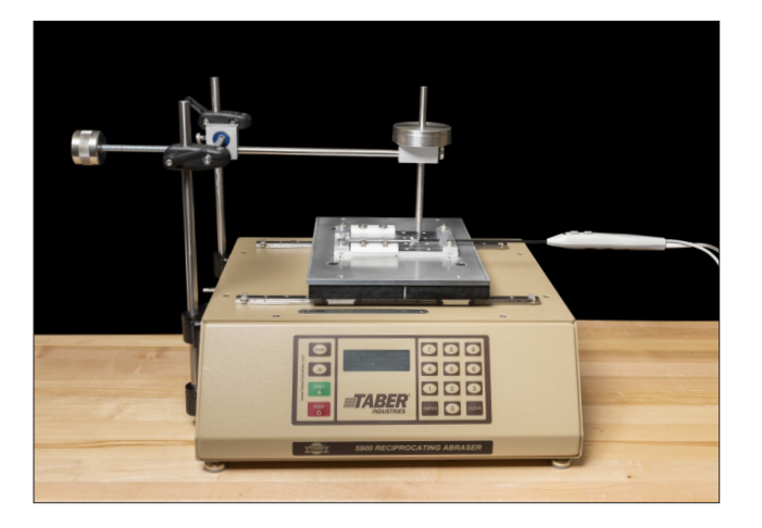
Figure 1. Test setup.

To simulate aggressive use, a weight was added to the test machine weight holder so the 20° angled stylus applied a 7 N load at the point of contact on the probe. The stylus on the counterbalanced arm of the