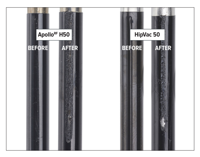
Figure 4. Test samples before and after insulation breach.

Data were normally distributed and a 2-sample t test was conducted to compare the results. The cycles before breach of the Arthrex Apollo<sup>RF®</sup> H50 device was statistically greater than that of the Smith & Nephew HipVac<sup>®</sup> 50 (48 ± 11 vs 13 ± 3 cycles, respectively) at the 0.01 level of significance.