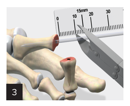
Insert the drill pin into the proximal phalanx, measure, and cut the pin obliquely to the depth of the middle phalanx.