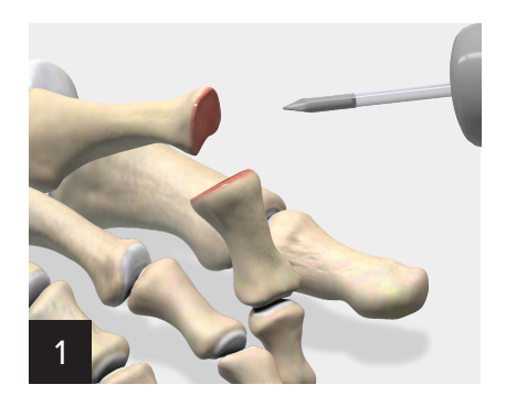
Use the metal pin to drill the depth of the proximal phalanx.

The TRIM-IT Drill Pin kit provides excellent fixation without the drawbacks of metal K-wires or pins. Created from an enhanced PLLA material that retains full strength through 24 weeks, the TRIM-IT Drill Pin kit improves patient comfort by providing solid fixation, without transdermal hardware or secondary removal procedures.