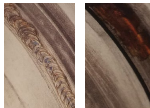
Third-party repair Improperly applied weld seam and/or use of adhesive resulting in poor or nonexistent sealing