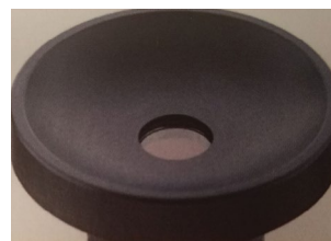
Third-party repair Gap formation as a result of nonoriginal component increases hygienic risks