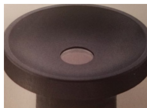
Original manufacturer Eyepiece attached gap-free