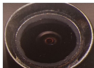
Third-party repair Copied objective lens