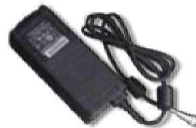
D Monitor Power