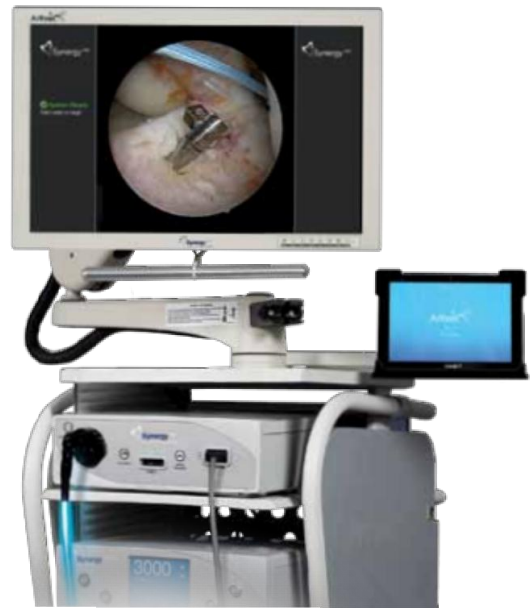
VIDEO CART AND BOOM ARM