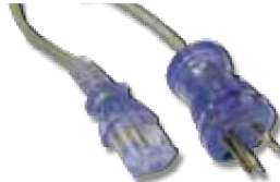
C Power Cord