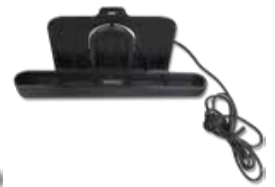
E Tablet Dock