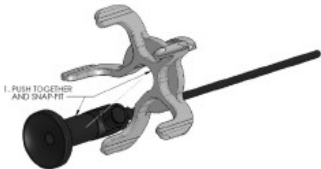
Figure 11-1: Installing Scope Snap-Fit