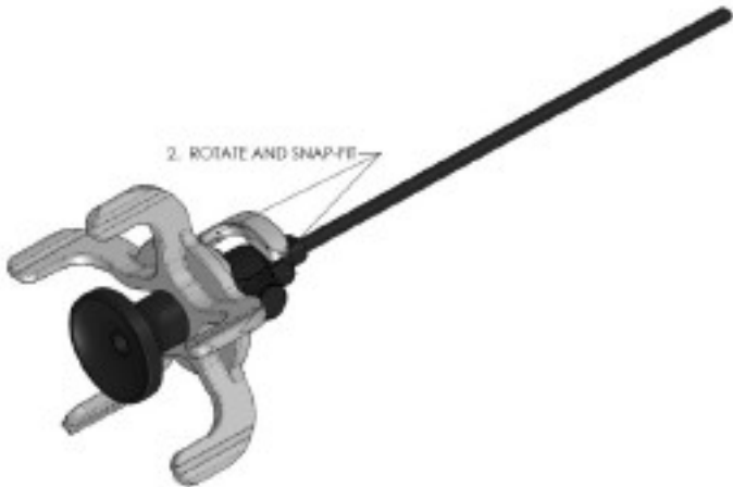
Figure 11-2: Installing Light Post Snap-Fit