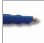
CoolCut Meniscectomy 45 AR-9802M-45