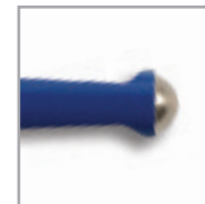
CoolCut SJ Ball AR-9808SJ