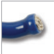
CoolCut 50NA AR-9803-50