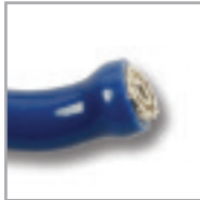
CoolCut 50 AR-9803A-50