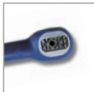
ToothBrush NA AR-9705-90