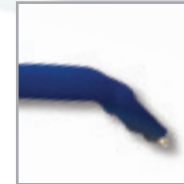
CoolCut Meniscectomy 90 AR-9802M-90