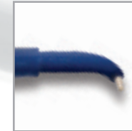
CoolCut Hook AR-9801