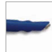
CoolCut SJ 45 AR-9809SJ-45