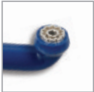
CoolCut 90 AR-9803A-90