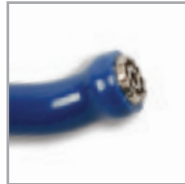
CoolCut 30 AR-9803A-30