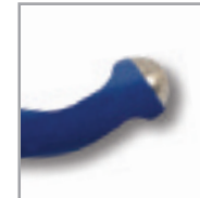
CoolCut Tip 45 AR-9808-45