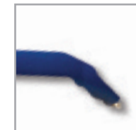
CoolCut SJ 90 AR-9809SJ-90