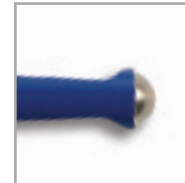
CoolCut Tip AR-9808