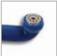
CoolCut 90NA AR-9803-90