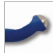
CoolCut SJ Ball 45 AR-9808SJ-45