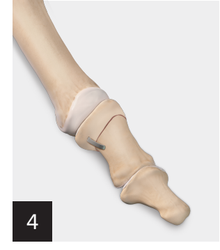
The low-profile DynaNite staple is seated flush to the cortical surface.

Once the DynaNite staple is inserted and seated against the bone, turn the delivery device knob counterclockwise until the staple is no longer under tension with the delivery device. Slide the delivery device away from the staple.