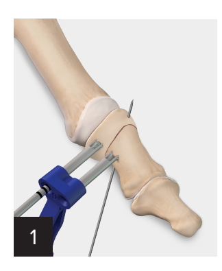
Center the DynaNite drill guide across the osteotomy site. Use the DynaNite drill bit to drill 2 holes at the osteotomy site. Note: The drill bit is laser marked to help drill to the correct depth.