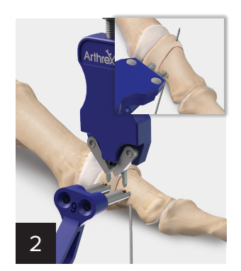
Use the windows in the drill guide to help position the tips of the staple legs into the drilled holes.