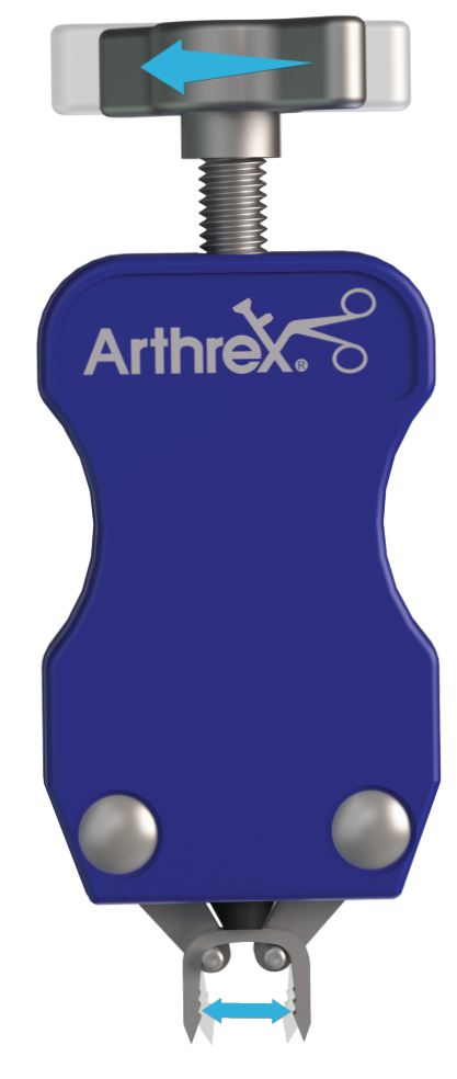
Adjustable Staple Legs