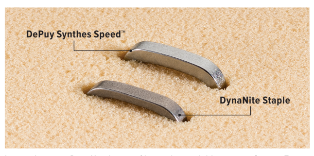
Image depicts a DynaNite low-profile staple, available in sizes: 9 mm \times 7 mm, 9 mm \times 10 mm, 11 mm \times 10 mm, 11 mm \times 12 mm, and 11 mm \times 15 mm

1. Arthrex, Inc. LA1-00068-EN (APT 3322). Naples, FL; 2017.