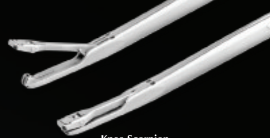
Knee Scorpion AR-12990