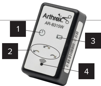
Button Activation Receiver

If the footswitch has a low battery, the battery LED will turn RED . At this time, you will need to replace the batteries and press a button or pedal on the footswitch to clear the warning light. It is not necessary to pair the footswitch with the receiver again. Red light will remain on when there is a low battery. From the time the red light appears, the battery will die within 10 hours.