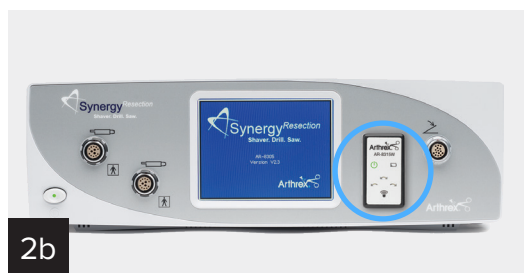
2b Placement is shown above.