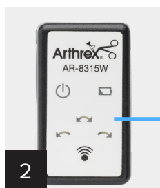
2 Fully connect receiver...