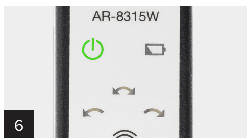
6 When the red flashing light disappears, the footswitch is paired. Note: The footswitch must be laid flat on the ground to function. If pairing is unsuccessful, repeat the previous steps and ensure that the batteries have sufficient power.