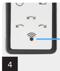
4 Pairing button - Pair footswitch by simultaneously pressing the receiver and footswitch pairing buttons, then release (footswitch must be within 6 feet of the receiver during this process). Note: The footswitch must be held vertically so that the handle is facing the ceiling when pressing the pairing button.