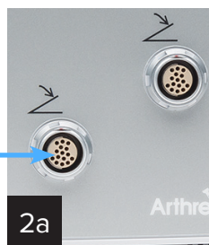
2a ...to footswitch port on console.