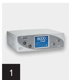
1 Power ON console.