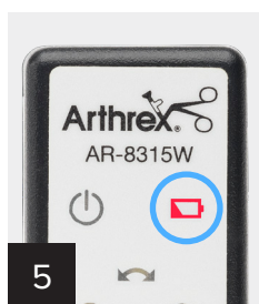
5 Battery indicator light will rapidly flash red during pairing phase (can take up to 11 seconds).