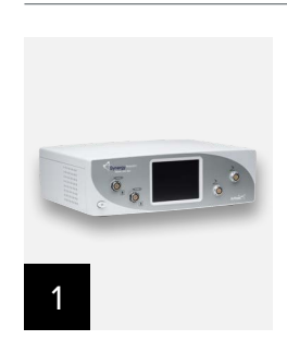
Place console on a flat, dry surface.