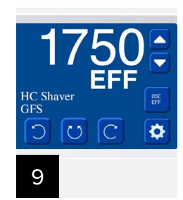
Speed, directional, and oscillate settings can be changed using the touch screen. Other optional settings are found by pressing the menu button in the bottom right corner.