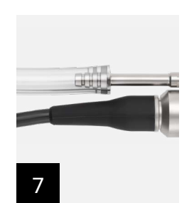
Attach suction tube to handpiece.