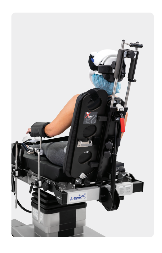
Beach Chair w/ Components