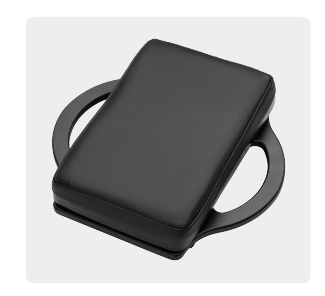
Intubation Pad and Plate