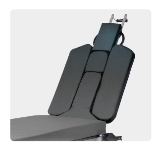
Beach Chair w/ Reusable Pad Set