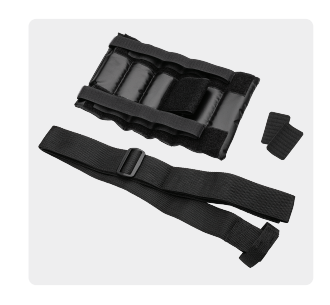
Reusable Security Strap