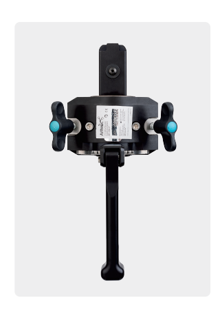
US Clark Rail Clamp