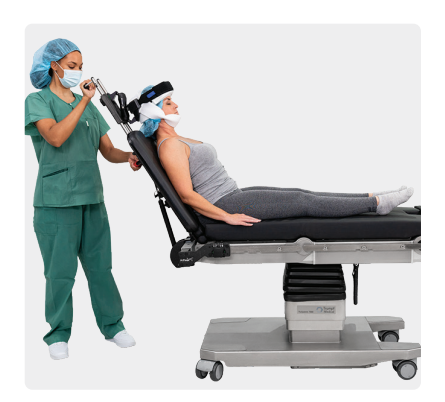
Easy to adjust and position with liftsupport pistons.