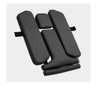
Reusable Pad Set