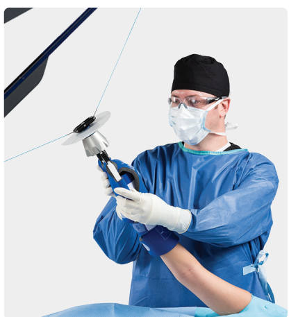
Sterile control of internal/external rotation frees staff to focus on the procedure instead of manual positioning.