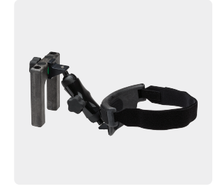
UHP w/out Harness