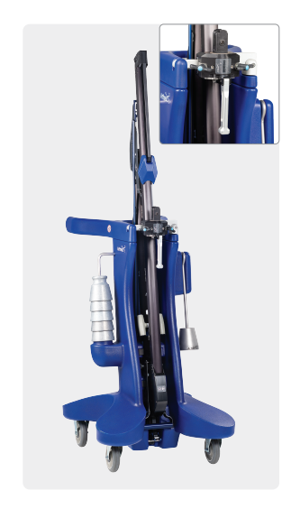
Lightweight, simple to set up, and easy to fold for storage on a convenient cart with a small footprint.