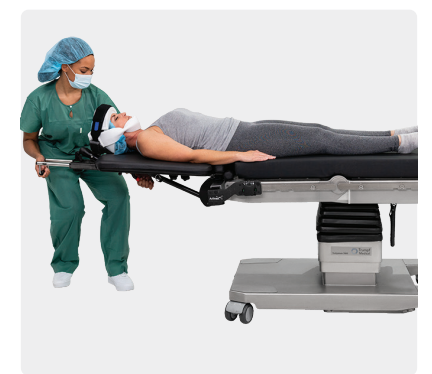
Safe and supportive. Simple adjustments can be made using the lift-support handle.