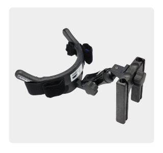
UHP w/ Harness