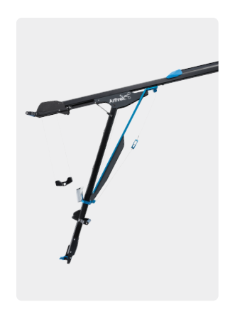
Shoulder Suspension Tower