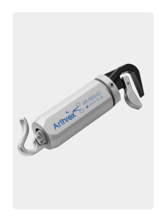
Lateral Traction Sleeve Connector