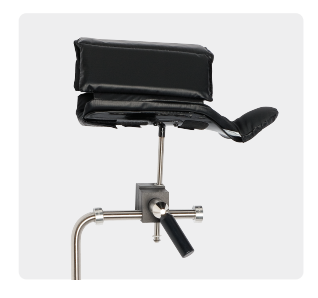
LPS Arm Support