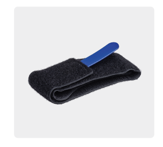
UHP Replacement Strap