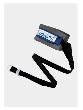
Lateral Traction Sling