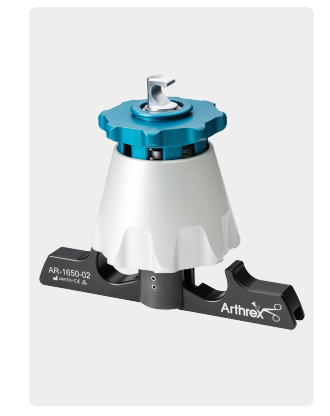
Arm Sleeve Connector