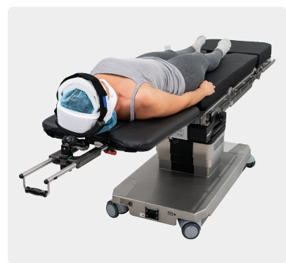
Lies flat for anesthesia access.