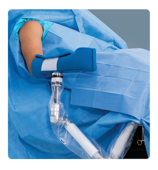
Shoulder and Elbow