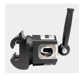
Easy Lock Socket