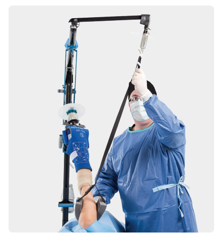
Direct lateral joint distraction is easily applied and can be directed anterior or posterior with a safe and secure padded strap.