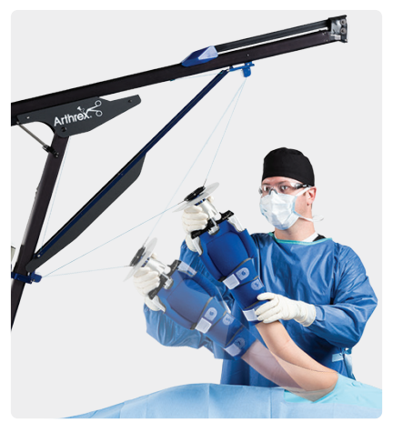
Intraoperative control of abduction/ adduction provides ultimate management of direct positioning. The arm can easily be disconnected and reconnected to allow full rangeof-motion testing.