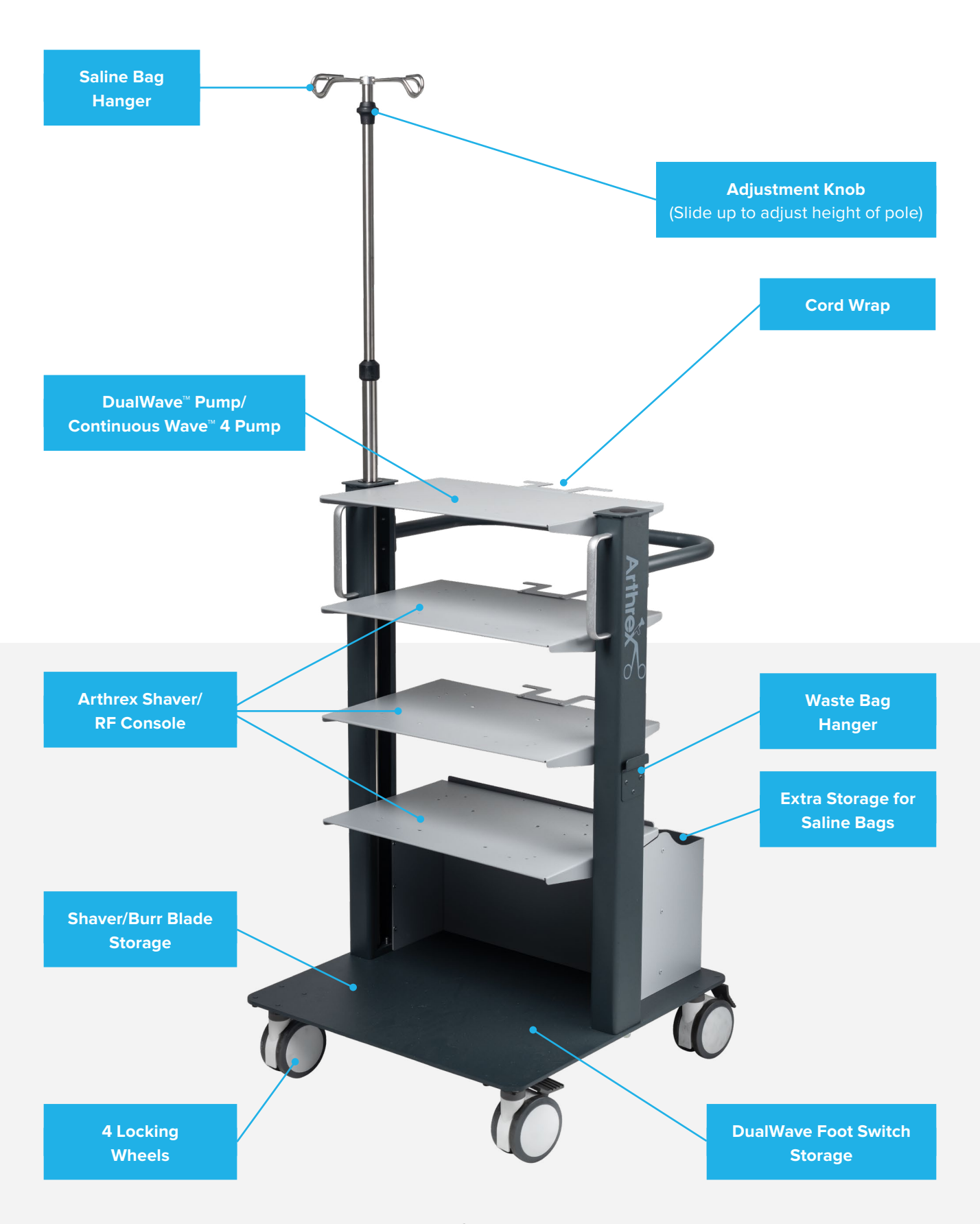
Pump Cart Features 1