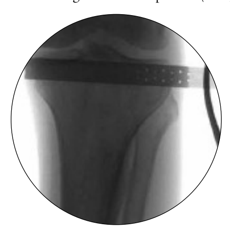
Figure 1. Tibial Size Assessment

The iBalance HTO Instrument System and the iBalance HTO Implant are sized to accommodate a variety of tibial widths. To achieve an optimum implant fit, the patient's tibial width is determined and the implant size selected accordingly. Imaging systems which use a calibration object in the image can be used to accurately assess the tibial width. However, the tibial width can be determined intra-operatively using the iBalance HTO Steel Rule, which comes with easily viewable holes drilled at specific intervals. The intra-operative technique for determining the tibial width requires two fluoroscopic images; one anterior and one posterior to the knee while the knee and the fluoroscope are maintained in a fixed position. The two measurements are then averaged to compensate for magnification and parallax (see Figure 1).