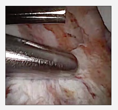
Debridement of ACL Cyclops lesion