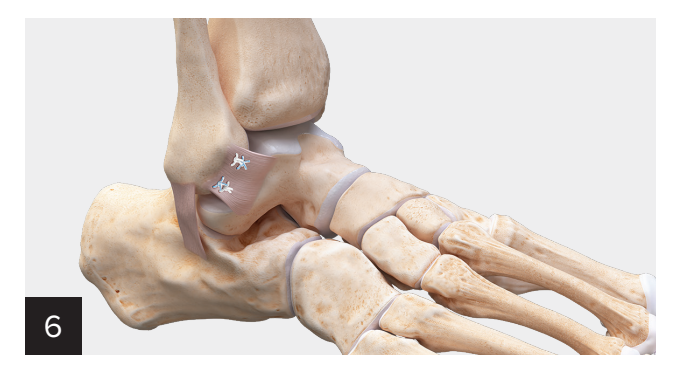
Final fixation of the Brostrom repair.

With the foot in maximum dorsiflexion and eversion, using the 0.9 mm SutureTape and needles from the DX FiberTak double-loaded anchors, proceed to pass the sutures through the soft tissue and tie them down to the fibula to complete the Brostrom repair.