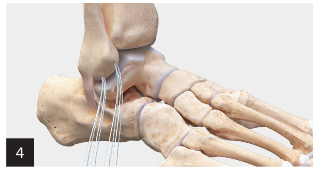
Repeat steps with the second DX FiberTak double-loaded anchor, placed about 2 cm from the distal tip of the fibula.

Pull back on the anchor handle about 5 mm to 8 mm behind the drill guide to seat the anchor against the cortical bone. After removing the drill guide, set the anchor in the bone by pulling back on the sutures.