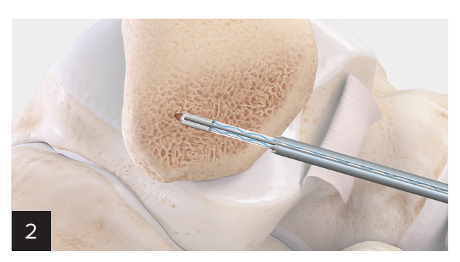
Keeping the drill guide in place, insert the DX FiberTak anchor and impact until the handle is flush with the guide.

Measuring about 1 cm from the distal tip of the fibula, use the DX FiberTak® drill guide and a 1.35 mm K-wire to create a bone tunnel. The drill should be inserted to the automatic stop at the back of the drill guide.