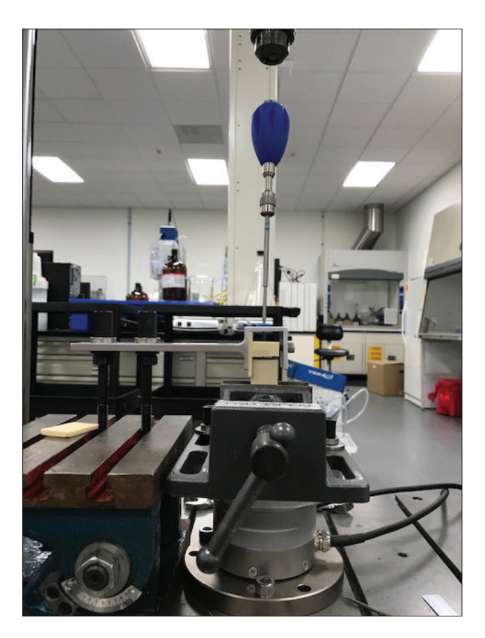
Figure 1. Screws were inserted into two foam blocks with a 2 mm gap.

The load-torque cell was activated to begin recording data at 1000 Hz, and the screw was inserted into the bottom block. A pause of several seconds occurred once the screw head appeared to be flush with the upper surface of the top block, and then insertion continued beyond full insertion, until the insertion torque was no longer increasing. Six samples of each screw type were tested. Student t tests were used to compare differences between the two sample groups.