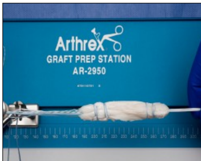
Figure 1: A GraftLink construct example

screw samples. Each was sized to match the diameter of the graft being used. The GraftLink samples were secured by pulling the ACL TightRope Button through the 3.5 mm tunnel and tensioning the pull-sutures to draw the GraftLink into the socket. The pull-sutures were tied over the button in a surgeon's knot. The interference screw graft samples were whipstitched, pulled into the tunnels, and fixated with either an 8 mm x 28 mm or 9 mm x 28 mm interference screw, to match the graft and tunnel diameters. Mechanical testing was performed using an INSTRON 8871 Axial Table Top Servohydraulic Testing System (INSTRON, Canton, MA), with a 5kN load cell attached to the cross-head. The