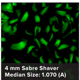
Figure 1. Representative images of cartilage particulate (differing letters denote p<0.05)<sup>4</sup>

Lastly, the potential for chondrocytes to migrate out of the cartilage chips and into a fibrin matrix was assessed. Bovine blood was processed on the Angel<sup>®</sup> system (Arthrex) to isolate platelet-poor plasma (PPP), which was used with the Thrombinator<sup>™</sup> system to generate autologous serum. Shavings were mixed with a fibrinogen source (PPP) and thrombin serum in a 2:1:1 ratio to yield cylindrical constructs. The constructs were cultured for two weeks, then stained with the LIVE/DEAD assay. The constructs were examined for evidence of chondrocyte migration.