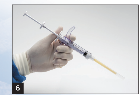
Depress plunger body to dispense material into cannula.