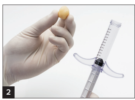
Prepare DBM product and insert into syringe body.

Kit components: angled or blunt tip cannula, syringe body and tapered end cap with end cap plug, plunger body with distal vented stylet and stopper, proximal stylet, and funnel.