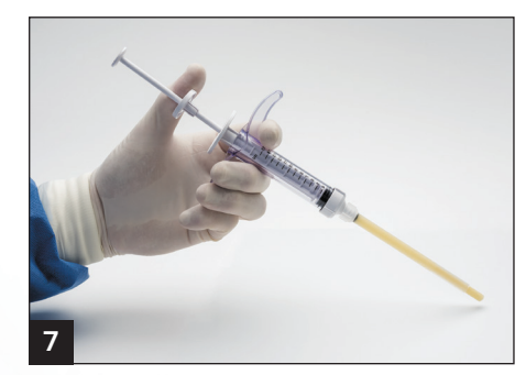
Depress secondary thumb tab to dispense material to surgical site.