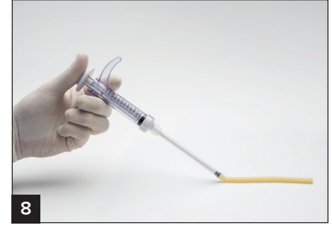
Depress proximal stylet to dispense remaining material to surgical site.