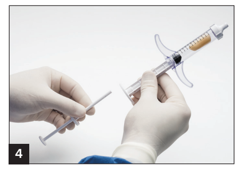
Thread proximal stylet onto distal stylet.