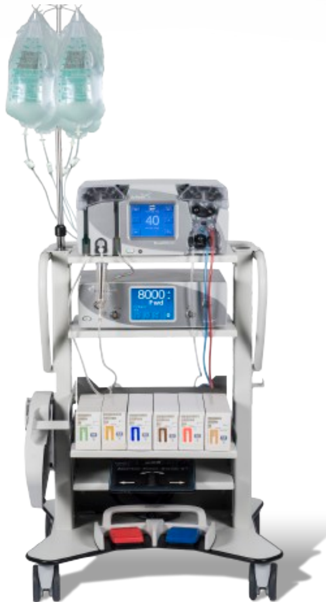
DualWave Arthroscopy Pump shown on optional mobile cart with Synergy Resection System. Cart may be configured for storage of fluid bags, shaver blades and/or foot pedals.

You will clearly see the difference with an Arthrex DualWave Arthroscopy Pump.