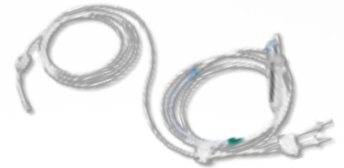
AR-6410 Main Pump Tubing