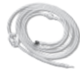
AR-6220 Extension Tubing