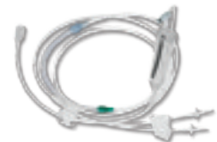
AR-6411 ReDeuce Pump Tubing