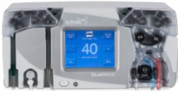
AR-6480 DualWave Arthroscopy Pump