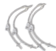
AR-6215 Y-Tubing Adapter