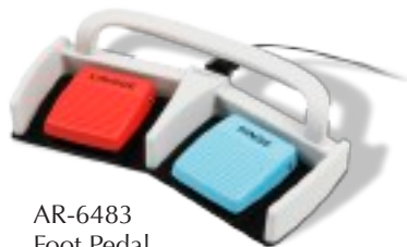
AR-6483 Foot Pedal