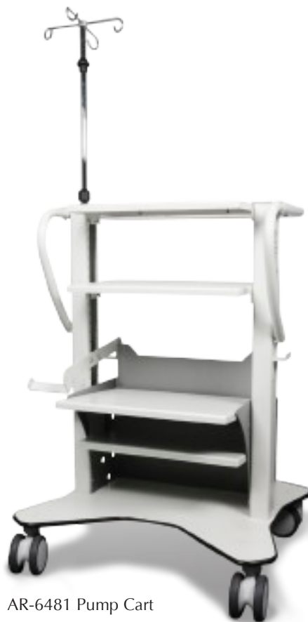
AR-6481 Pump Cart