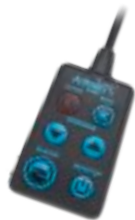
AR-6482 Autoclavable Remote Control