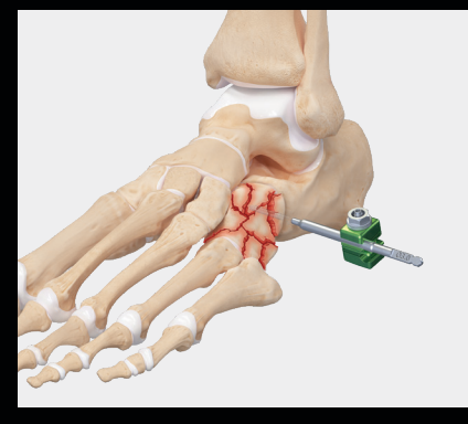
Attach a 5 mm single clamp to the pin.