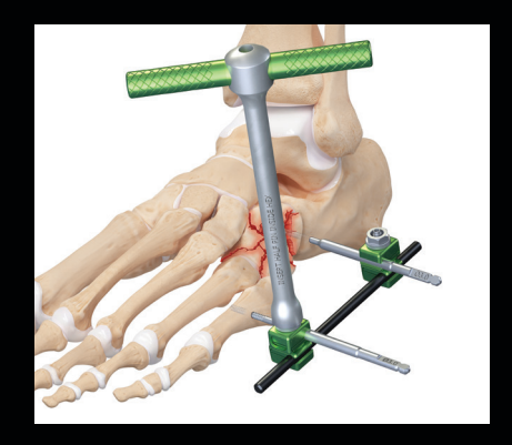
Insert a second pin into the 5th metatarsal and attach a single clamp. Place a rod between the two clamps and lock the construct into place using the T-handle.