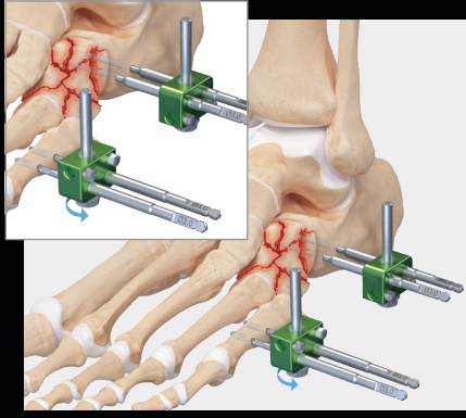
Repeat the process on the 5th metatarsal. Place extension rods in the multipin clamps and lock the construct into place using the wrench.