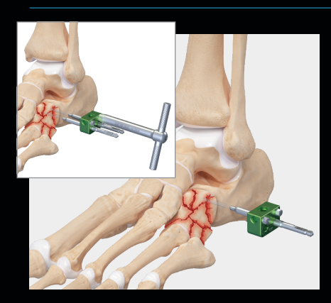
Place the first pin then slide the multipin clamp over it. Place the second pin through the clamp for two-pin fixation in the calcaneus. Set the clamp using the smaller T-handle.