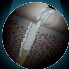
2.4 mm BioComposite PushLock® with SutureTape