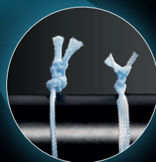
#2 suture vs. 1.3 mm SutureTape

* Arthrex Research and Development, Mechanical and Biomechanical Comparison Testing of 1.3 mm SutureTape Sutures, © 2017 Arthrex, Inc. All rights reserved. LA1-00038-EN