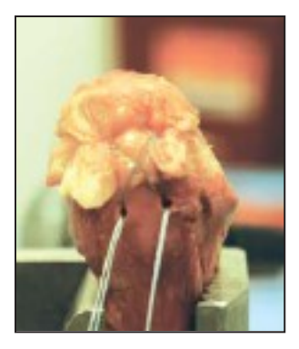
Figure 2: SpeedBridge