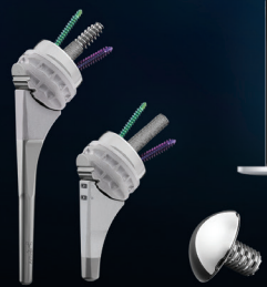
Univers Revers™ Eclipse™