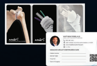
Patient Journey Cards