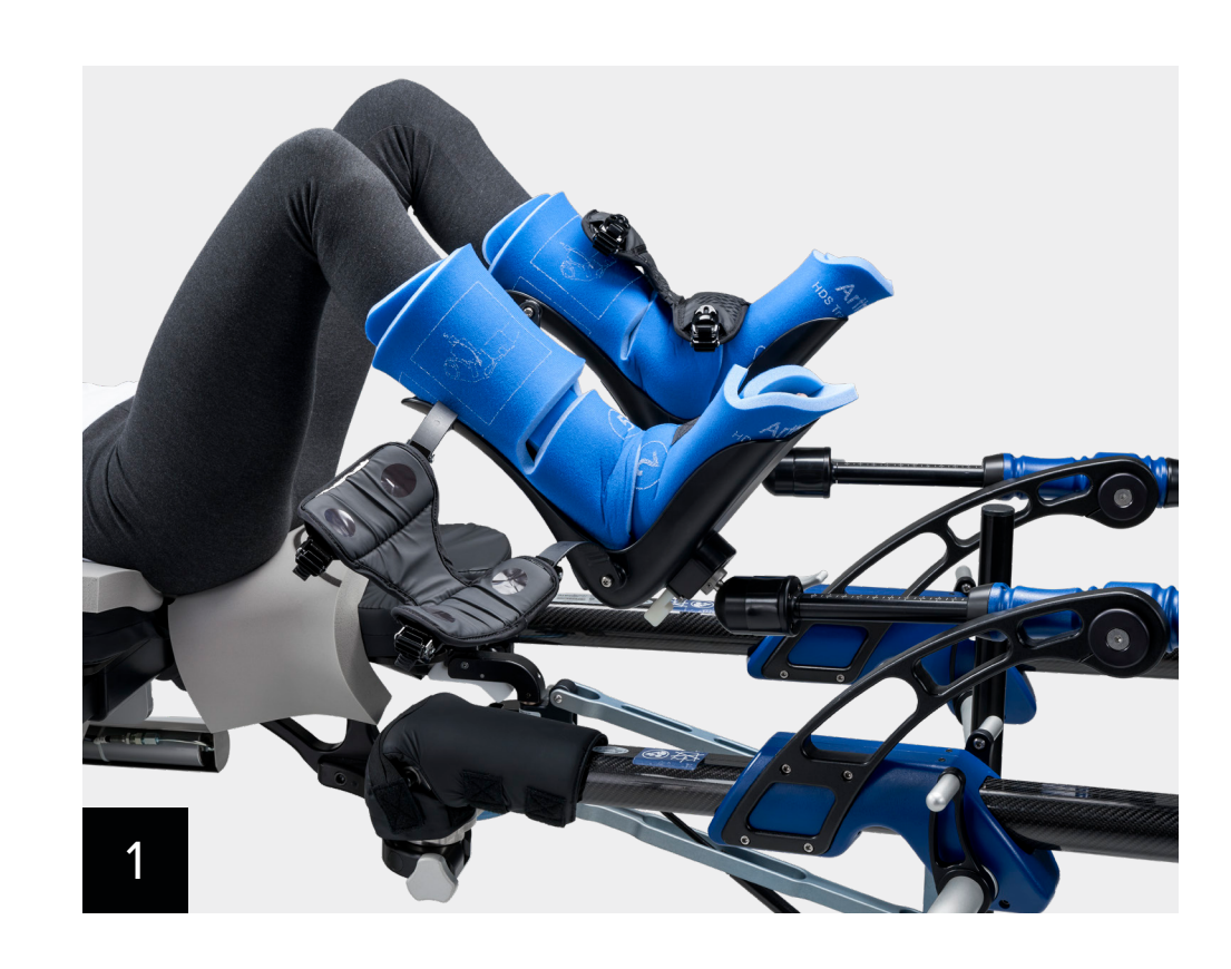
Place the foot into the flexed HDS traction boot (AR- 6529-23 ).