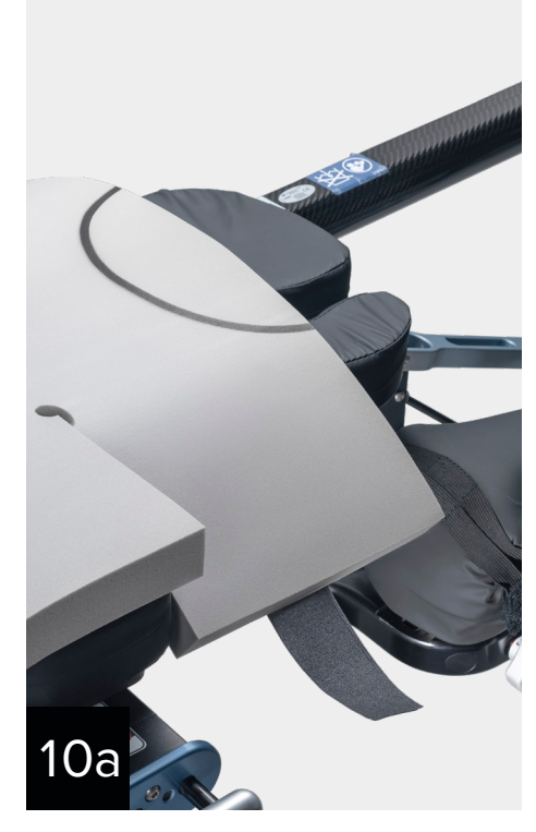
Optional: Place the postless pad (AR-6529-22) on the OR bed and secure with the Velcro straps when performing a postless hip arthroscopy procedure.