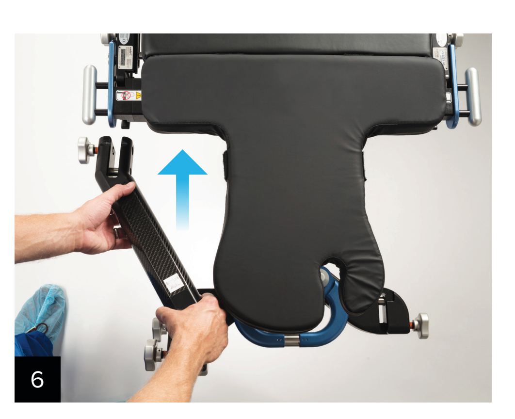
Attach and lock the HDS well leg spar adapter (AR- 6529-15 ) to the bottom of the HDS table clamp.