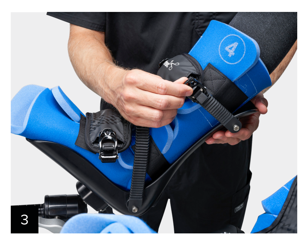
Tighten the ratchet down to secure the instep pad over the foot.