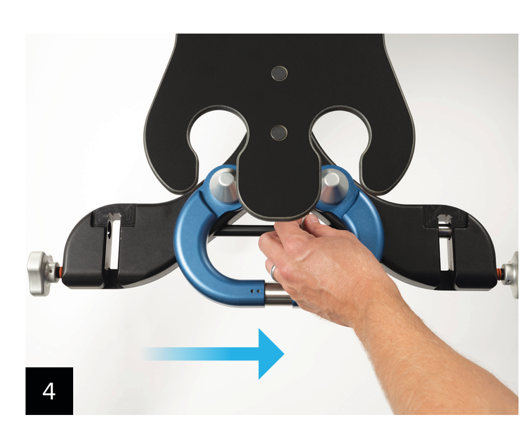
Slide the mounting pin on the HDS patient platform toward the operative side.