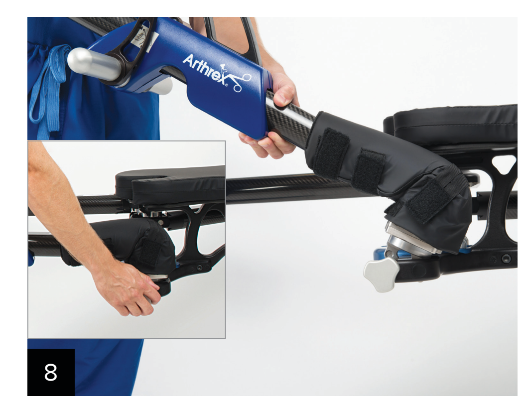
Attach the operative leg spar (AR- 6529-05 ) to the HDS patient platform.