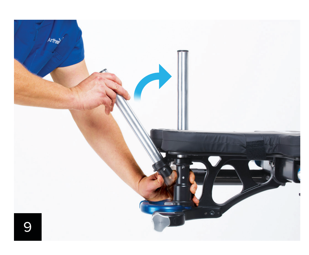
Attach the HDS perineal post (AR- 6529-07 ) to the operative side of the patient platform.