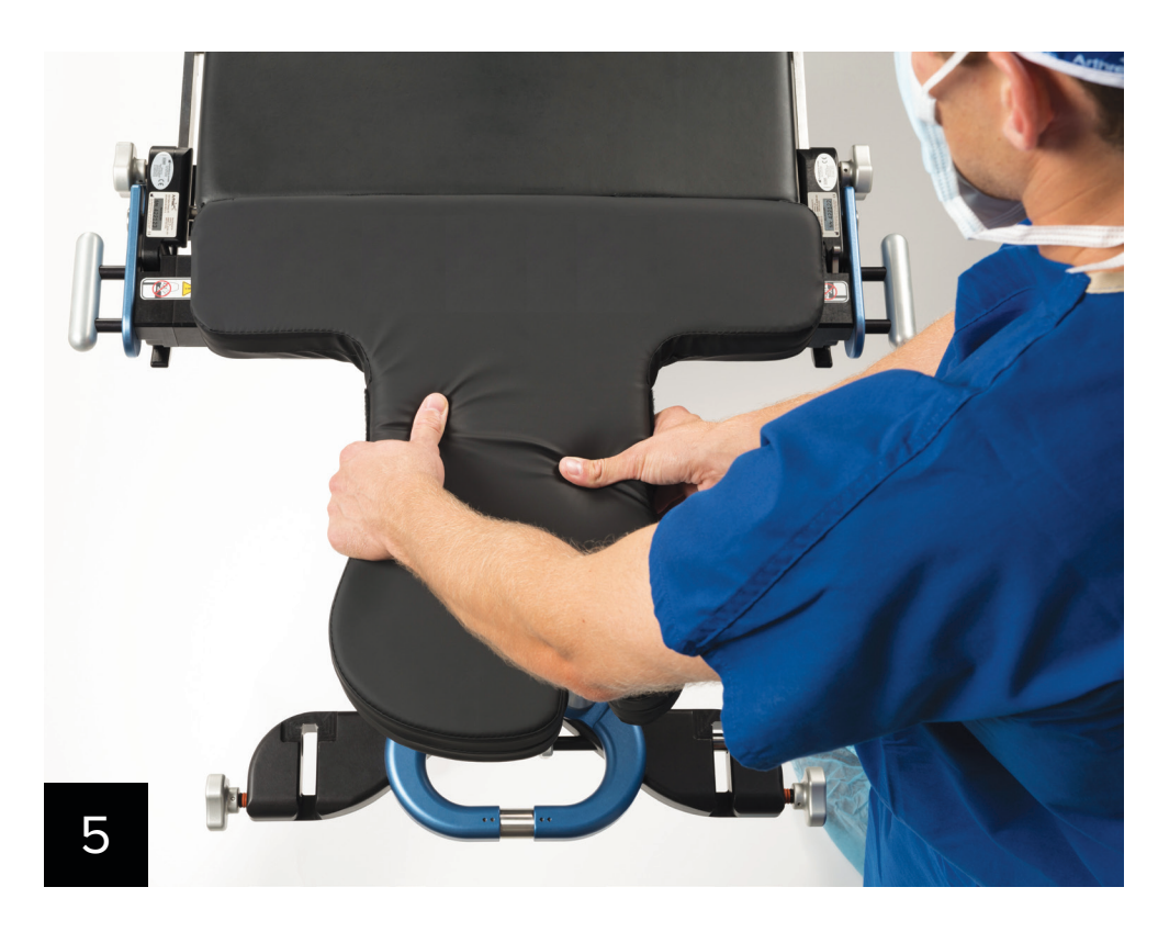
Place the reversible HDS patient platform pad (AR- 6529-02 ) over the HDS patient platform.