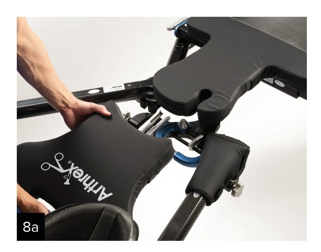
Optional: Attach the optional HDS prep table (AR- 6529-03 ) to the HDS patient platform.