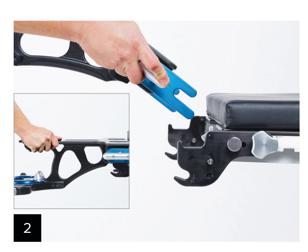
Attach the HDS patient platform (AR- 6529-01 ) to the HDS table clamps.