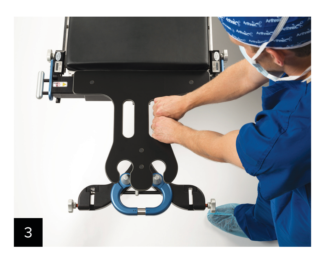
Grasp the slot in the HDS patient platform and pull it toward the operative side.