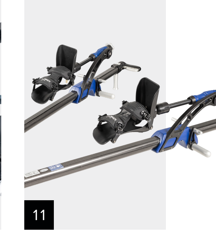
Attach the HDS traction boots (AR- 6529-23 ) to both Teletrac carriages.