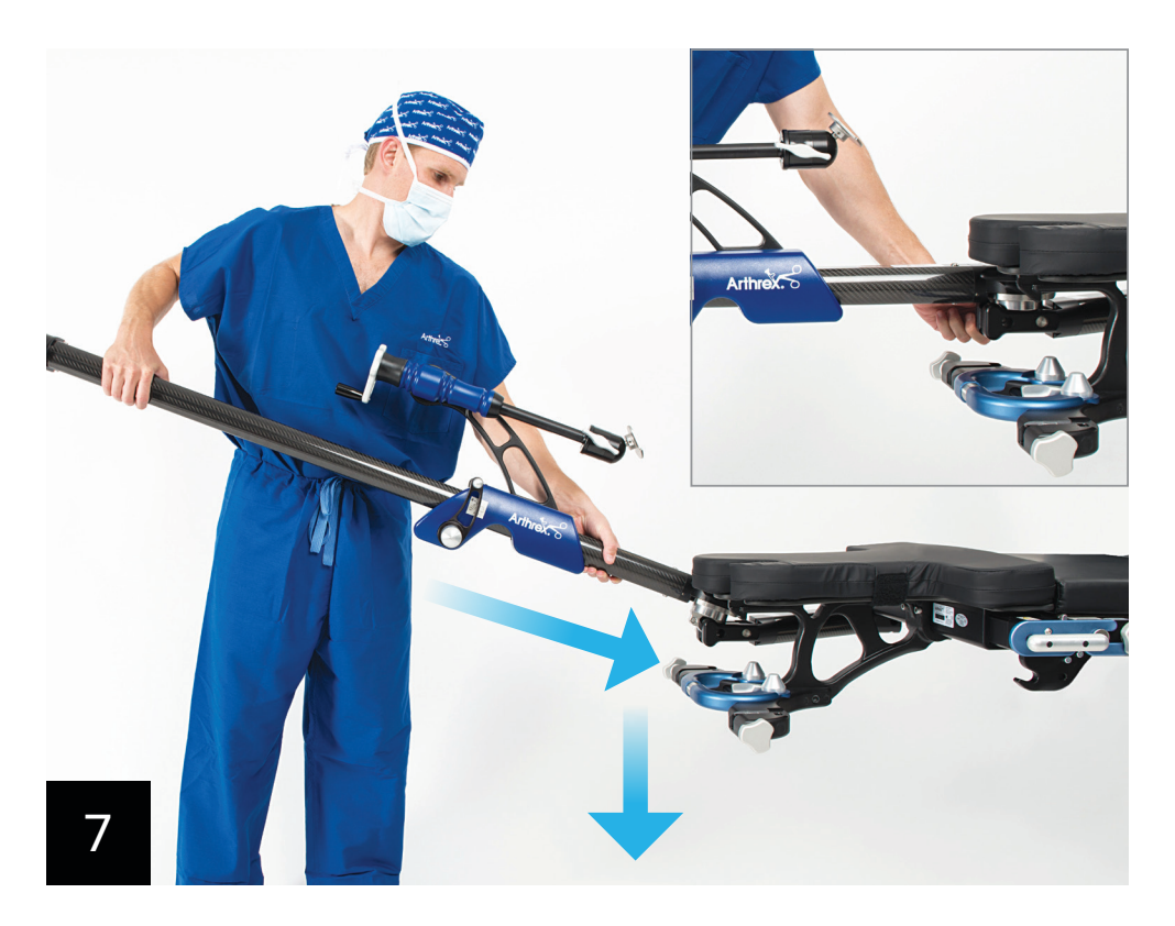
Attach the HDS well leg spar (AR- 6529-14 ) to the well leg adapter.