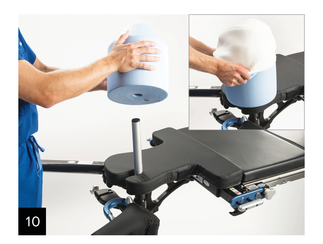
Place the reusable HDS perineal post pad (AR- 6529-08 ) with the HDS perineal post pad cover (AR- 6529-11 ) over the HDS perineal post.