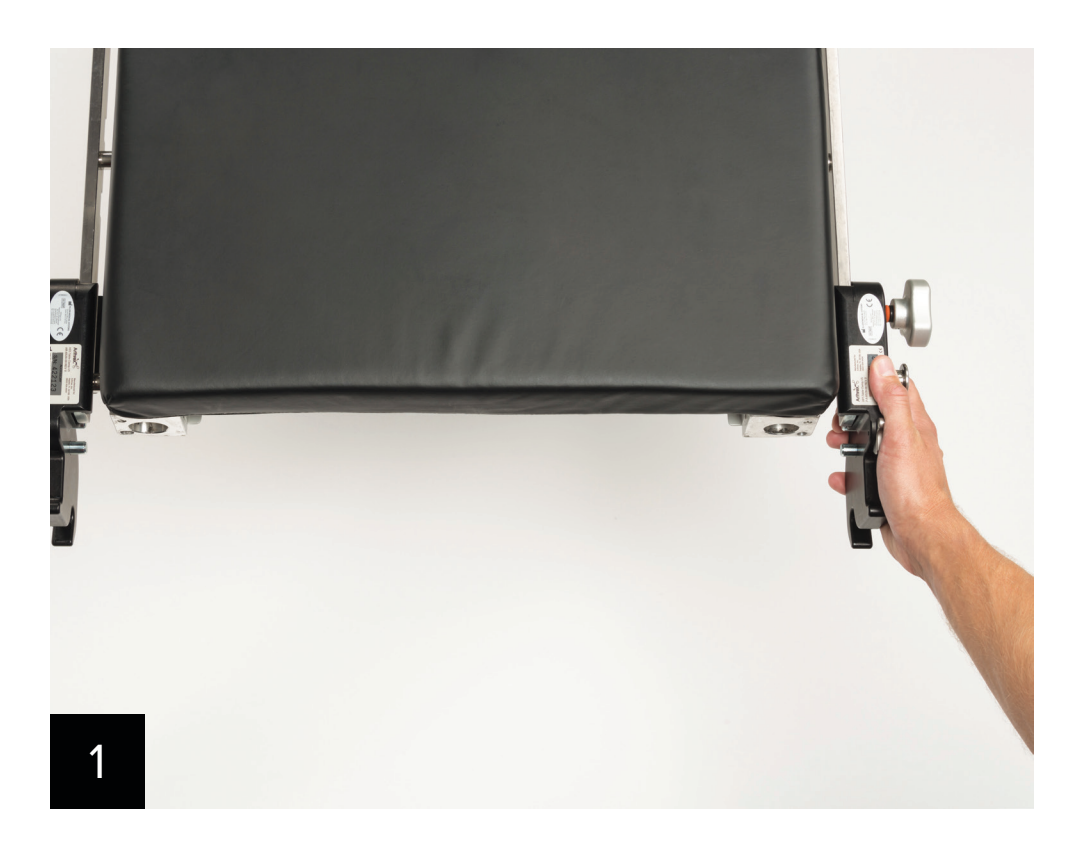
Slide the appropriate HDS table clamps over the Clark railings on each side of the bed and lock them in place.