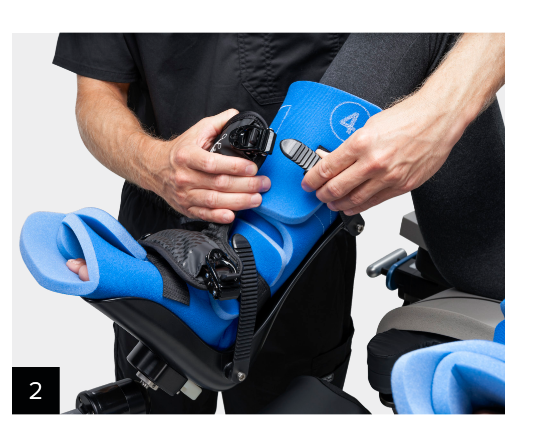
Place the instep pad over the top of the shin and foot and insert the top strap on the boot through the ratchet on the instep pad.