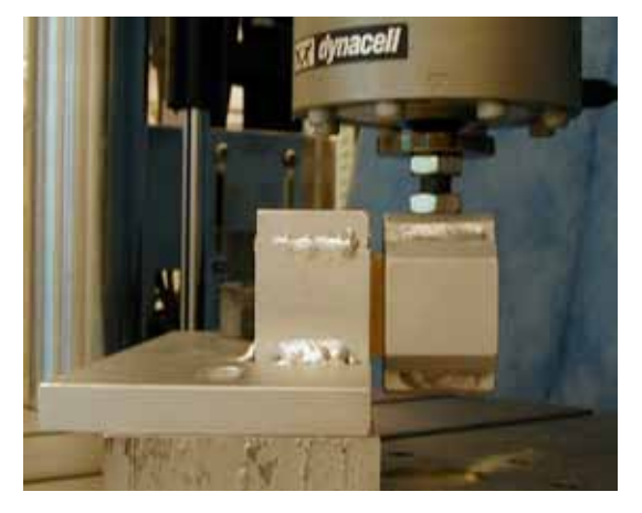
Figure 1: Syndesmosis repairs were bolted to an INSTRON machine

Syndesmosis repairs were simulated using two 30 lb/ft3 polyurethane blocks. The TightRope Syndesmosis Repair construct was tied off with a surgeon's knot with three alternating half-hitch knots; the Synthes screw was countersunk so the screw head was flush with the block. Mechanical testing was performed using an INSTRON 8871 Axial Table Top Servohy-draulic Dynamic Testing System (INSTRON, Canton, MA) with a 5 kN load-cell secured to the cross head. One polyurethane block was bolted to the load-cell and the other polyurethane block was bolted to the load-cell and the other polyurethane block was belted to the base of the INSTRON (Figure 1). A 5 mm gap was left between the two fixtures. The constructs were cycled to failure from zero to 2.4 mm displacement in tension, the normal distal migration of the fibula secondary to contraction of the foot flexors during stance and push-off gait phases<sup>1</sup>. A sample size of three was tested in each group.