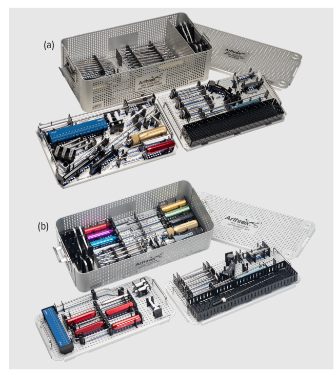
ACL and PCL ToolBox Set (a) AR-1900S, (b) AR-1269S