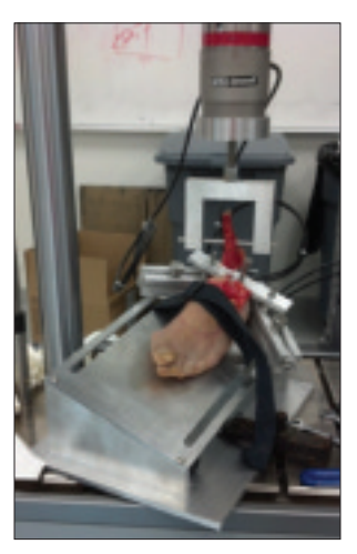
Figure 1: Complete testing setup

The average maximum load for each group is presented in Table 2 and illustrated in Figure 2. The results of the two-way ANOVA indicated that the order in which anchors