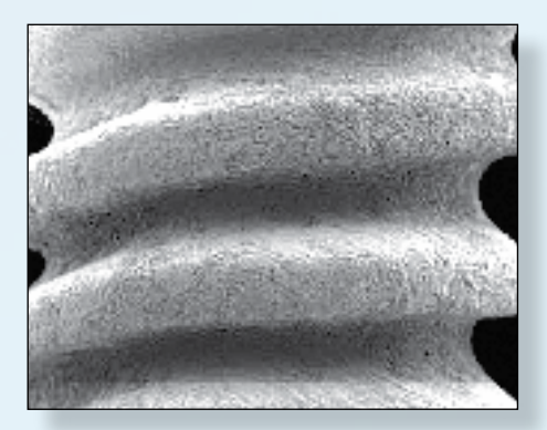
SEM: 25x Magnification