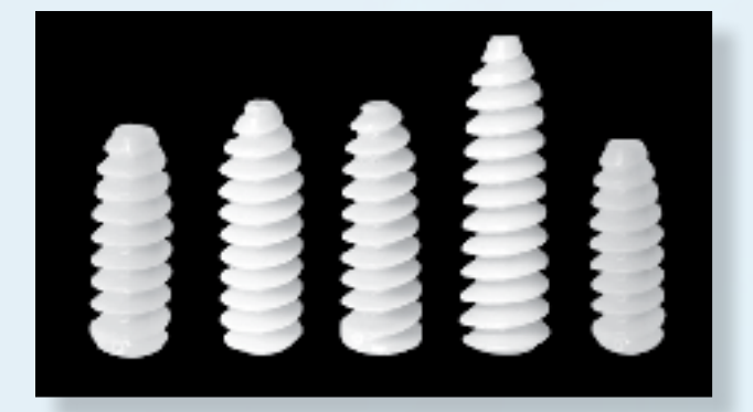
23 mm, 28 mm Full Thread, 28 mm Round Delta Tapered, 35 mm Delta Tapered Screws and 20 mm BioComposite RetroScrew