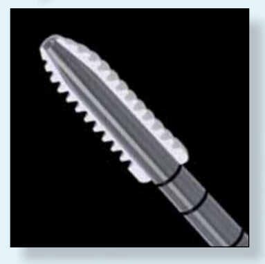
Cross-section of BioComposite Screw