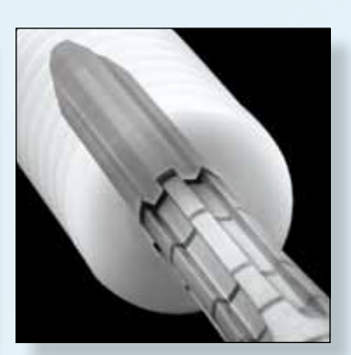
Hexalobe Driver Interface of the BioComposite Screw