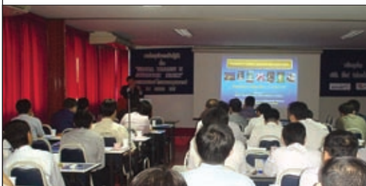
Presentation at the Chulalongkorn University

With over 25 years experience in the orthopaedic industry, Arthrex represents a dedicated commitment to provide simple, safe and reproducible surgical solutions in minimally invasive orthopaedic surgery. Our mission is to combine the finest quality engineered products with a comprehensive program of educational and support services to meet the needs of the orthopaedist and patient.