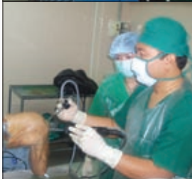
Wet Lab Workstations at the Chulalongkorn University